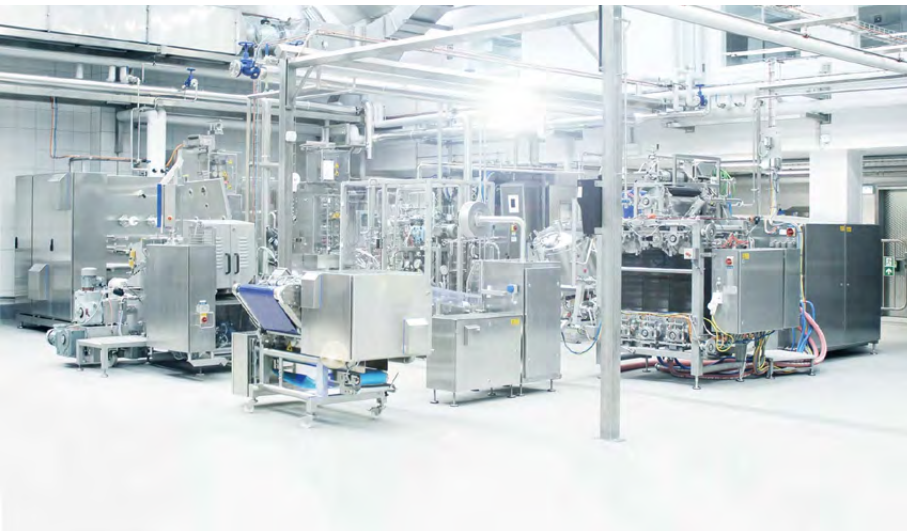
Natec Network Innovation Space