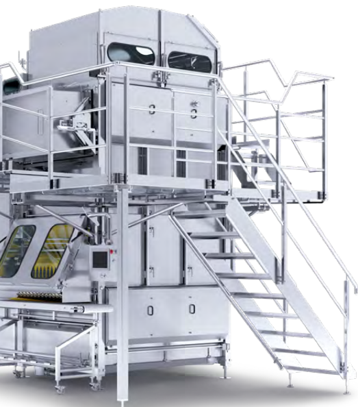
The "FreeSlice 1500" by Hochland Natec, a machine for the production of processed cheese slices, cubes and sticks